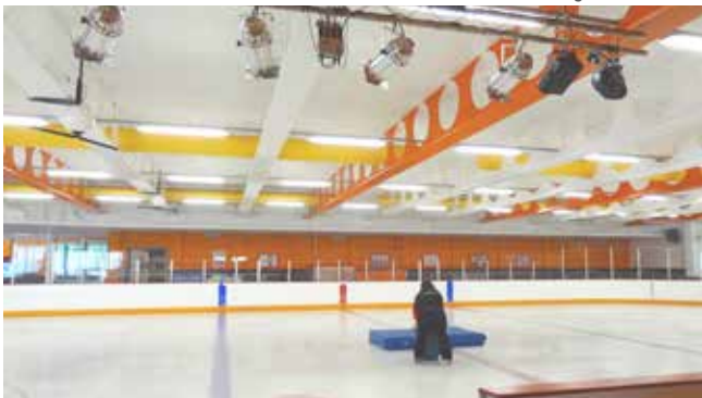
Community Ice Rinks