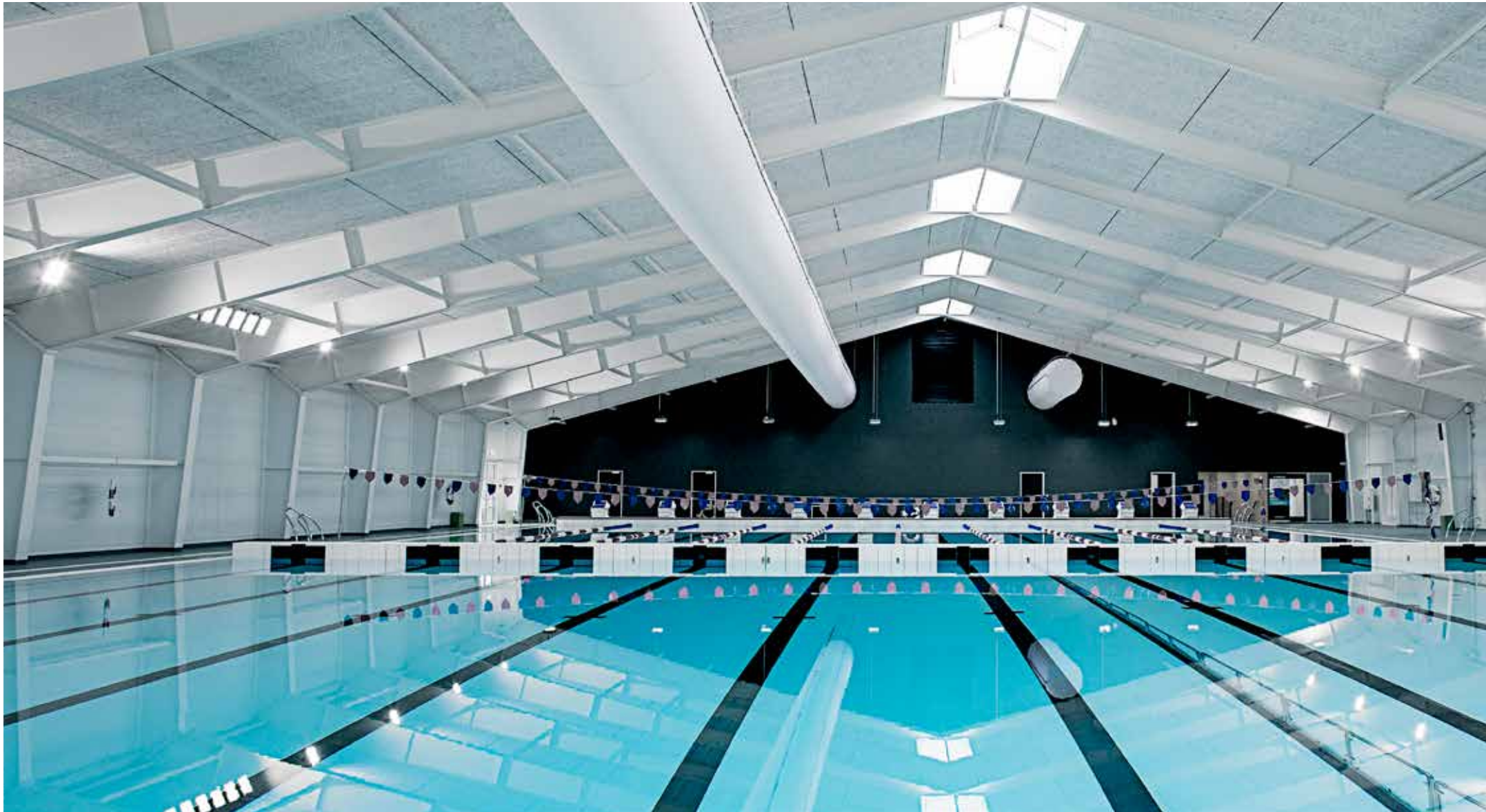
Customized to each zone