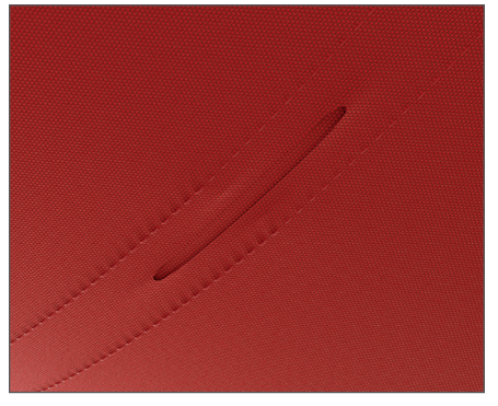
Internal 360° Hoops can be removed at the 6 o'clock position