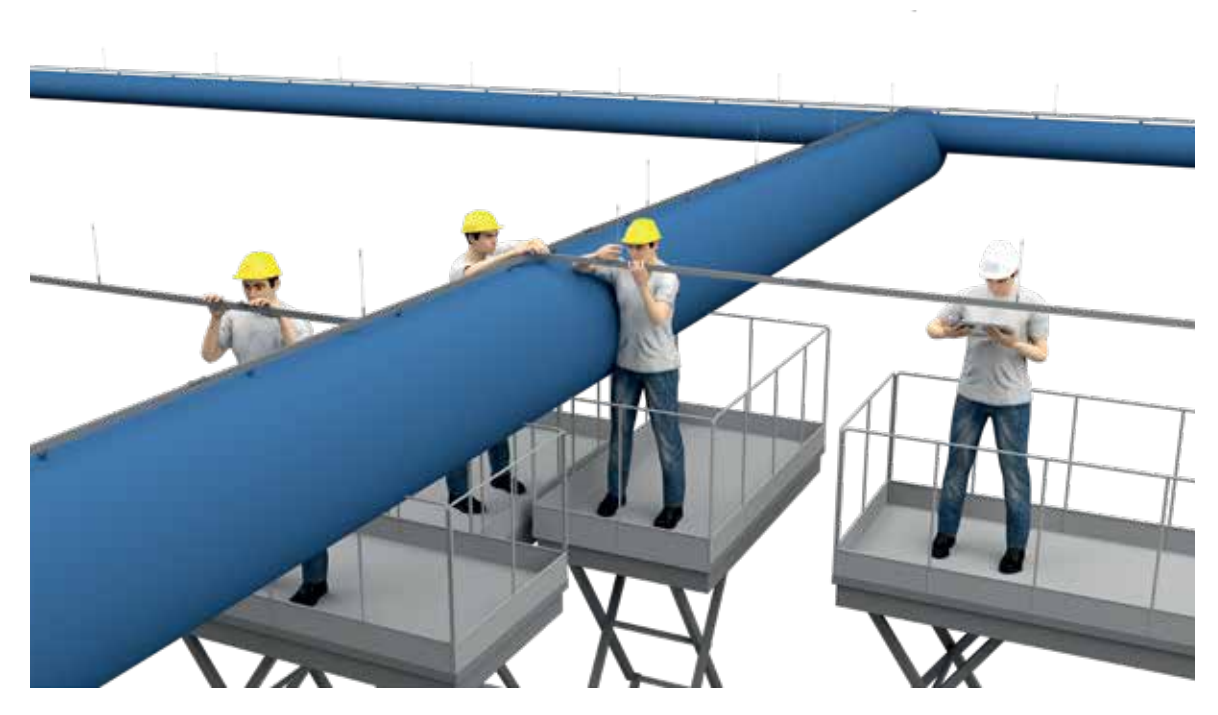
Ease of installation is a hallmark of the technology, and it is a good source of value engineering.